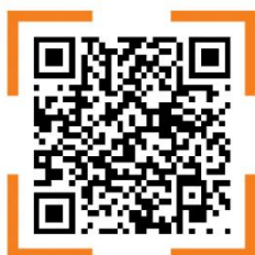
FANS Community WhatsApp group